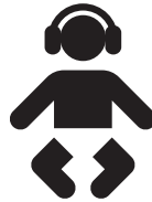
baby in noise canceling headphones