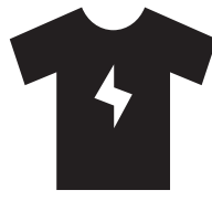
t-shirt with headlining band