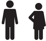
awkward first date