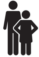
tall person in front of you