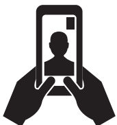
in-your-face face timing