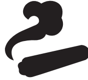
smell of weed