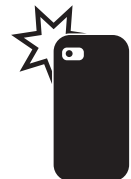
aggressive camera flasher